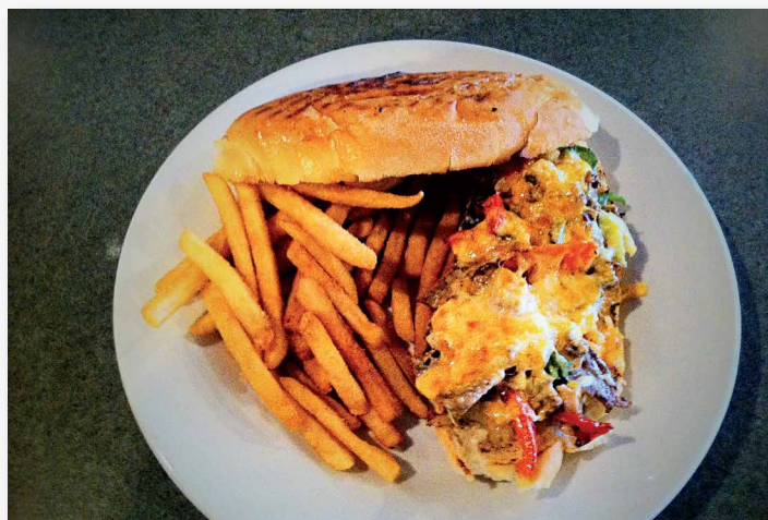
Philly Cheese Steak