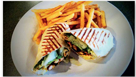
Blackened Chicken Caesar Wrap

Chicken smothered in BBQ sauce, with onions and mushrooms - baked with our cheese blend.