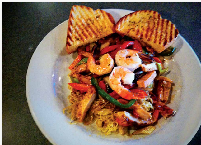
Combo Stir Fry

Vegetarian - $17.95 Chicken - $21.95 Beef - $22.95 Shrimp - $25.95 Combo - $23.95