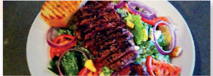
Fire & Ice Salad

Spinach, tomato, cucumber, hard boiled egg, bacon and shredded cheese in sundried tomato oregano dressing. Your choice of chicken or baby shrimp.