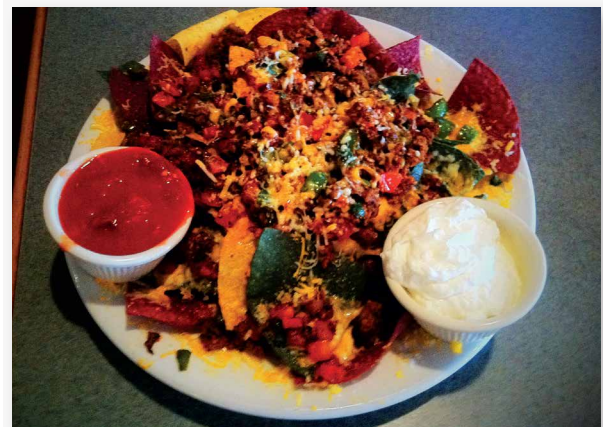
Pots Signature Nachos