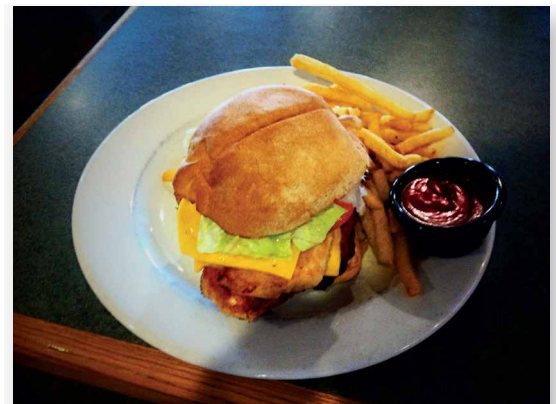
Big Bird Burger

6 oz chicken breast grilled and topped with sautéed vegetables and marinara sauce. Baked with our cheese blend.